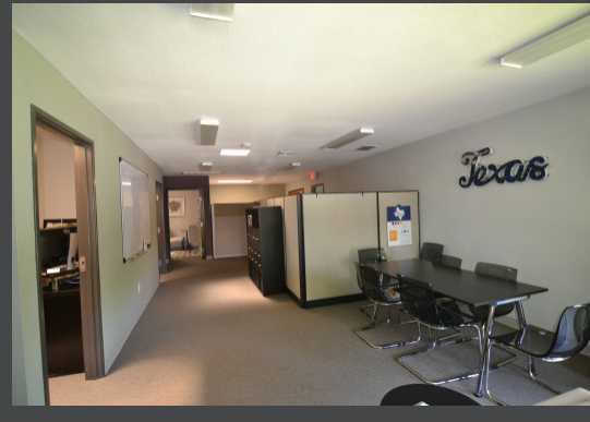
*Central Suite pictured above